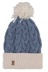
• White/Light Blue •