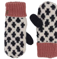
• Diamond Navy Blue •