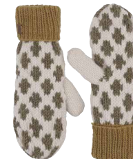
• Diamond Dusty Green •