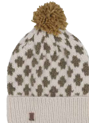
• Diamond Dusty Green •