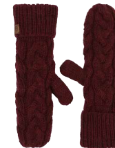
• Bordeaux •