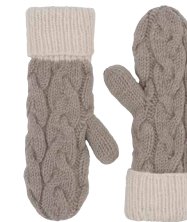
• Grey •