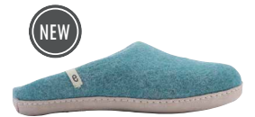
• Sea Blue •