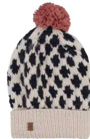
• Diamond Navy Blue •