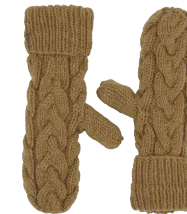
• Gold Brown •