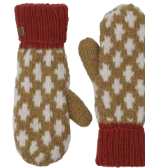
• Diamond Gold Brown •