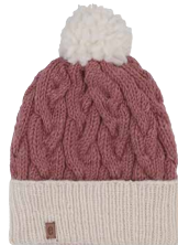
• Dusty Rose •