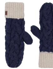
• Blue •