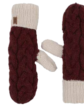
• White/Bordeaux •