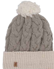
• Grey •