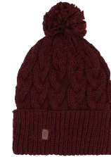
• Bordeaux •