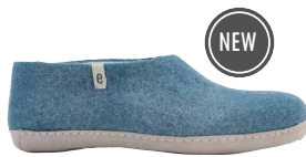
• Sea Blue •