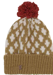
• Diamond Gold Brown •