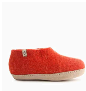
• Rusty Red •