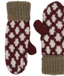
• Diamond Bordeaux •