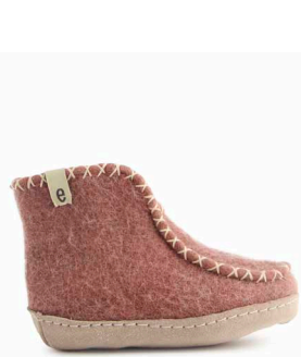
• Dusty Rose •