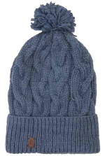
• Light Blue •