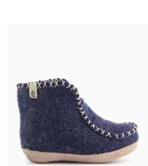
• Blue •