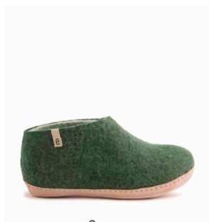
• Green •