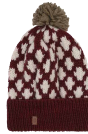
• Diamond Bordeaux •