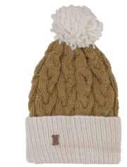
• White/Gold Brown •