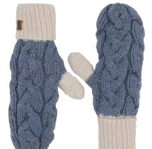
• White/Light Blue •