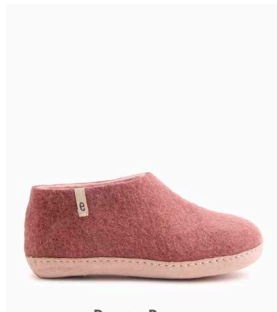
• Dusty Rose •