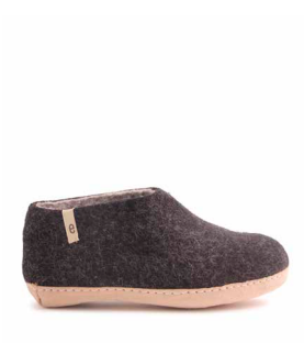
• Black •