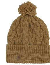
• Gold Brown •