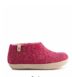
• Cerise •