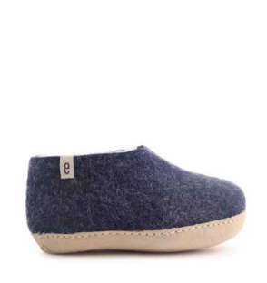
• Blue •