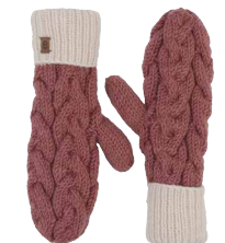
• Dusty Rose •