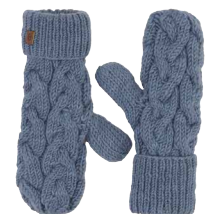
• Light Blue •