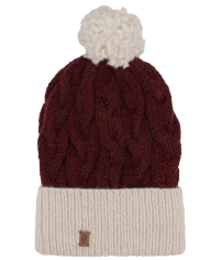
• White/Bordeaux •