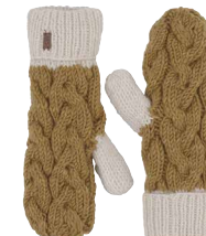
• White/Gold Brown •