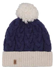
• Blue •