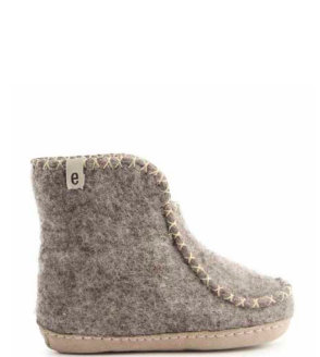
• Natural Grey •