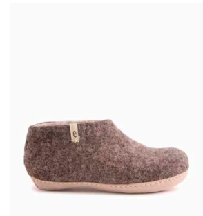
• Natural Brown •